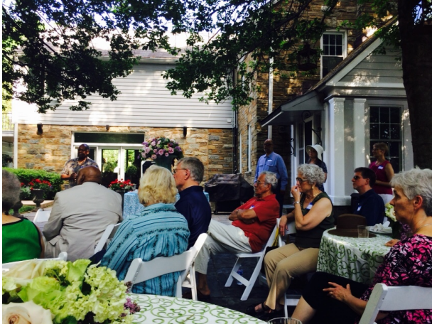
Guests at Garden Party on May 30, 2015