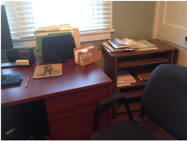
Office furniture donated by Pati Griffith

Pati Griffith has also indicated that our board may use her basement as temporary office space until we find a permanent home for the village.