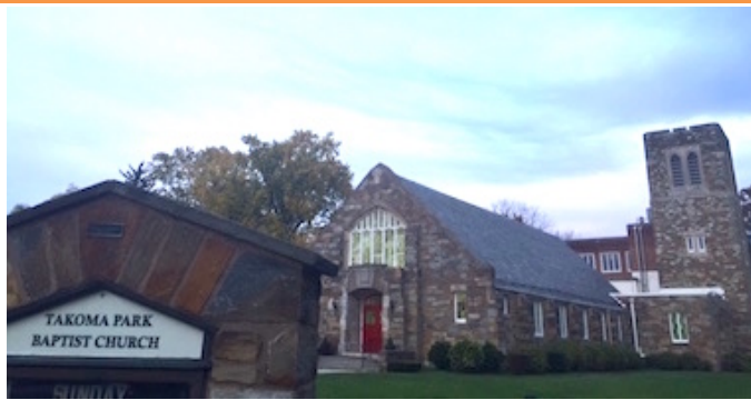
The Takoma Park Baptist Church